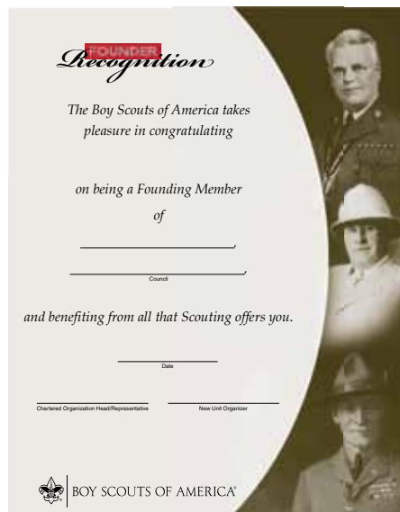
Founder's Bar Certificate, No. 34775